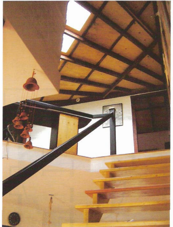
A glimpse of the interiors

bricks, and 'chapti stone'. There was also some clarity on a minimalist look – no ornamental brickwork. A lot of the details evolved on site, in collaboration with the masons. The niches, the slits at the staircase landing, the parapet wall, the courtyard wall, were all designed on site, the skill of the masons contributing a lot to the detail. The woodwork, in the roof too was worked out with the carpenters. Their expression of the vernacular often contradicted our 'controlled ornamentation'. Some of the decisions