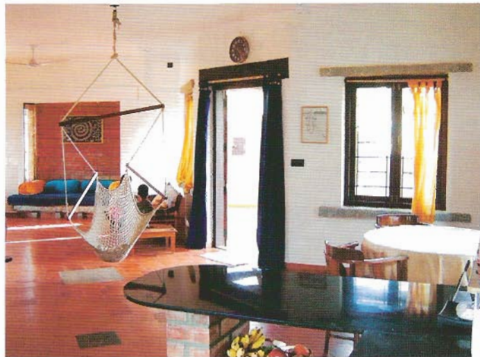
Top: The front façade Centre: A private rear courtyard Above: The informal family room